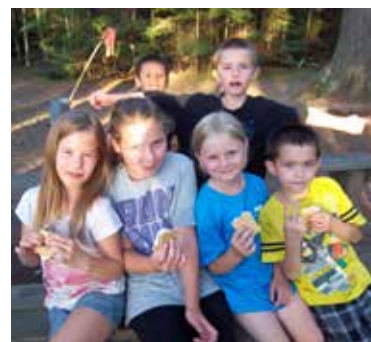
Smiles and s'mores weekly.

Return this form with a $50 deposit to reserve your child's spot at camp. A complete registration and information packet will be sent within ten days. If you have any questions please call Camp at 218-744-4683.