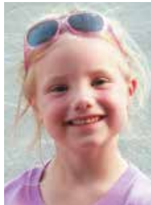
A Happy Camper